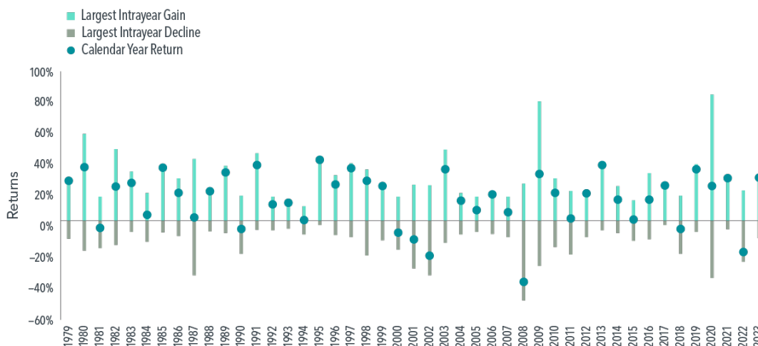
Exhibit 1 US Market Intra-year Gains and Declines vs. Calendar Year Returns 1979–2023

Indices are not available for direct investment; therefore, their performance does not reflect the expenses associated with the management of an actual portfolio.